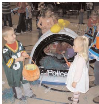
Wanna take a ride?

We also desired to present the message of the cross – Jesus died for our sins, and rose from the dead giving us power through the Holy Spirit over sin and death. This message was communicated through stories, crafts, songs, and the Jesus Film for Kids . This was in addition to the main draw – Easter egg hunts (with over 3000 eggs!) as well as games, snacks,