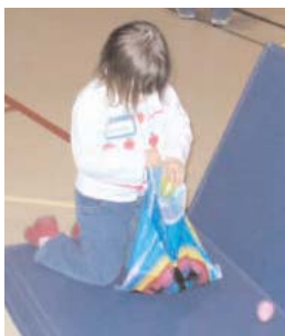
This takes concentration!