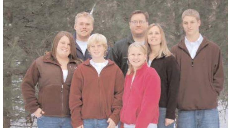
The Eichorst Family

SERVPRO is the name of the company that is handling the cleanup and restoration of our house. The whole rehab process is expected to take about 4-6