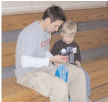
Hey Dad—there's candy in that egg!

On Saturday, March 15, the Second Annual Easter Egg Hunt was sponsored by the Married Couples Fellowship (MCF). Who knew that a simple Easter Egg